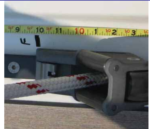
Mark located on deck and at forward end of the genoa car. Note the lifting lever at the front of the car.