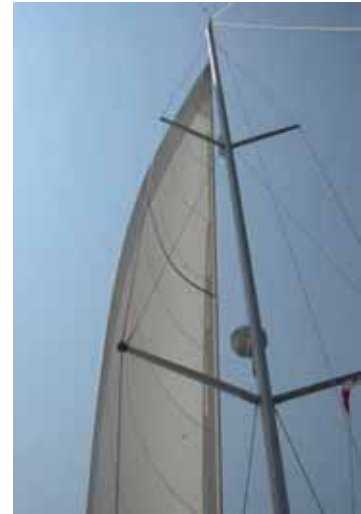
Leech trim, closed hauled and with full size sail. Note Mainsail is furled for ease of viewing.

With the genoa furled to the third 'reefing' mark the car should be moved forward until the front of the car is 6'-6" / 1981 mm aft of the outer shroud. Conditions requiring this third reef will be quite windy and depending on your comfort level may be put in place anywhere from 16 knots on up. This position will keep the foot of the sail quite tight, flattening the sail for good breezy performance.