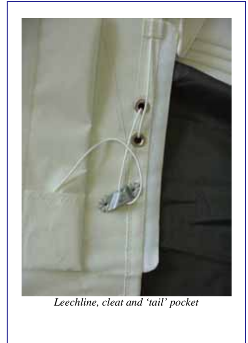
Leechline, cleat and 'tail' pocket

The first photo shows the leechline pocket opened to reveal the leechline, snubbing eyes, cleat and the 'tail' pocket. The snubbing eyes help to take the load from the line making cleating and un-cleating an easy task. The 'tail' pocket is on the inside of the leechline cover and you can put the excess leechline tail into this pocket before closing the cover. To adjust, take up the line by pulling downward just above the eyelets, taking up the slack in the line just below the cleat. Pull the line until the flutter stops. Cleat the line and insert the tail into the pocket and close the flap.