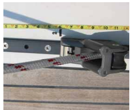
Car location when reefed to the second mark. Note the #2