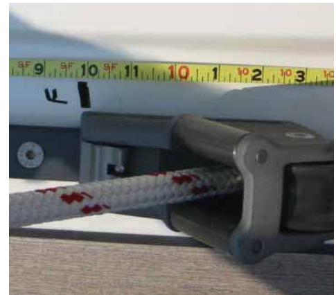
Track location with full size sail and 'F' for full size