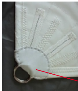
External stainless ring covered with handsewn leather.