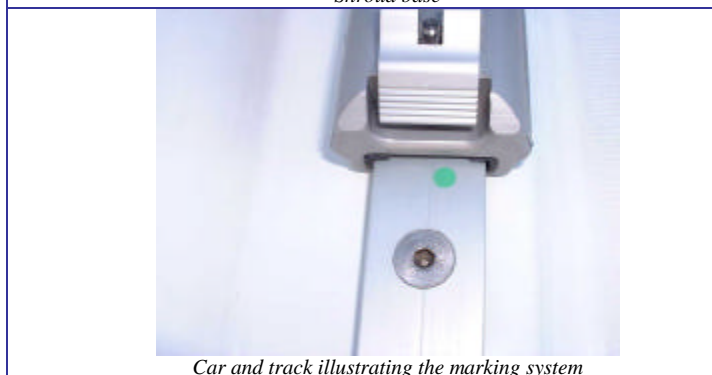
Car and track illustrating the marking system