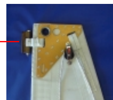
Super strong double aluminum headboards featuring hand sewn metal slides with webbing straps.