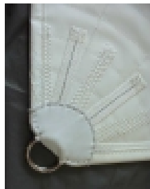
Strapped-in rings for ultimate durability.