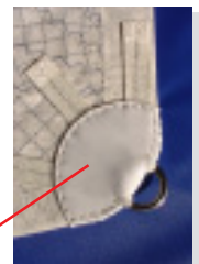
External corner rings finished with leather and 'capped' webbing straps.