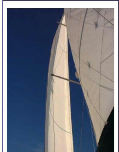
Leech trim, closed hauled and with full size sail