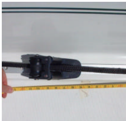
Car location with sail reefed to the first tack mark