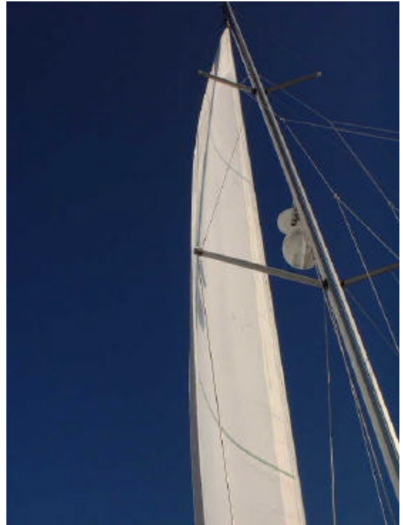
A genoa completely unfurled and trimmed up for sailing upwind in about 8 knots of breeze. You can see that it is just inside the upper spreader and a few inches off the lower spreader.