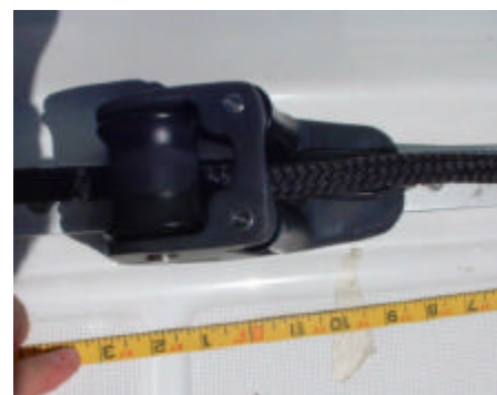
Car location when reefed to second mark