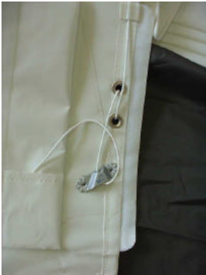
Leechline, cleat and 'tail' pocket

The first photo shows the leechline pocket opened up to reveal the leechline, snubbing eyes, cleat and the 'tail' pocket. The snubbing eyes help to take the load from the line making cleating and nucleating an easy task. The 'tail pocket is on the inside of the leechline cover and you can put the excess leechline tail into this pocket before closing the cover