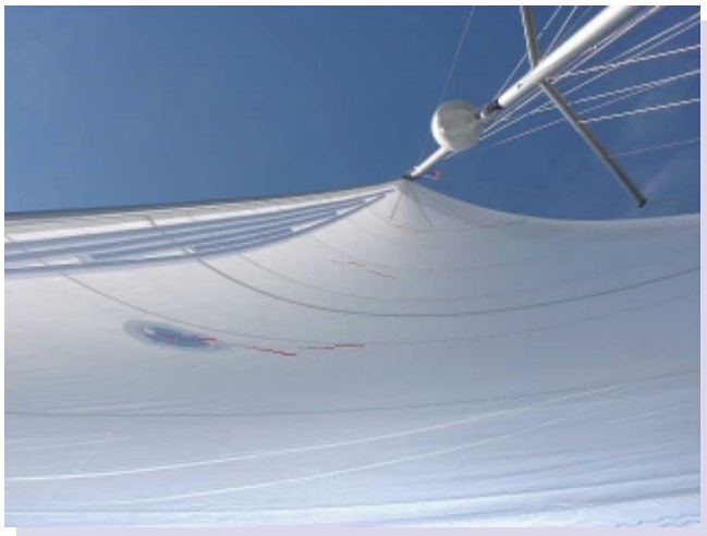
Here the sail is completely unfurled, the amount of shape (camber) is represented numerically and is 16% in the mid-section and 16.7% in the top section.