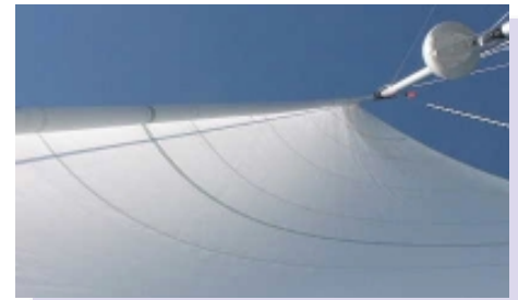
Smooth and even furling along the luff