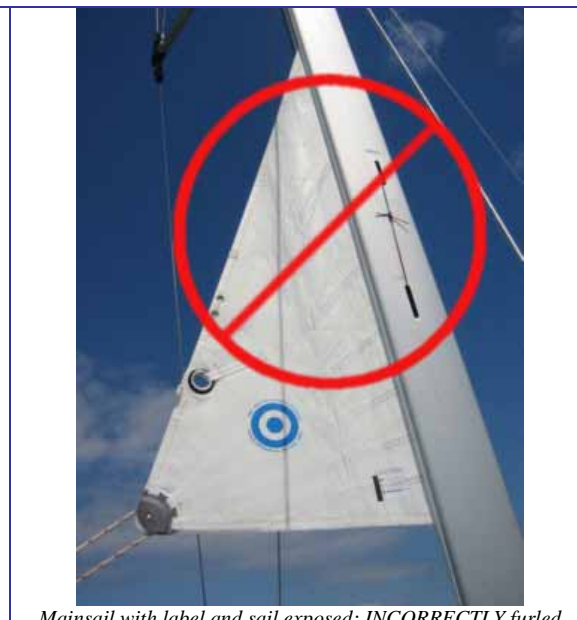
Mainsail with label and sail exposed; INCORRECTLY furled