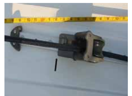
Car location when reefed to second mark.