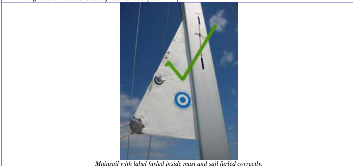
Mainsail with label furled inside mast and sail furled correctly.