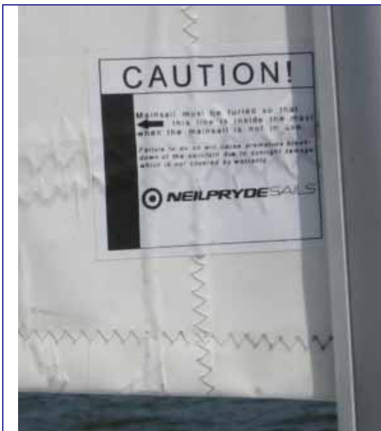
Furling Label on starboard side of mainsail clew patch

Roller Furling Mainsails are equipped with a small label on the starboard clew of the sail. This is designed as a 'marker' that will indicate when the mainsail is furled inside the mast enough so that the U.V. cover on both sides of the sail will protect the sail. It is imperative that the sail be furled so that the label is clearly inside the mast, thus protecting the sailcloth from harmful U.V. which will damage the sailcloth quickly.