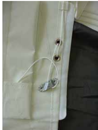
Leechline, cleat and 'tail' pocket