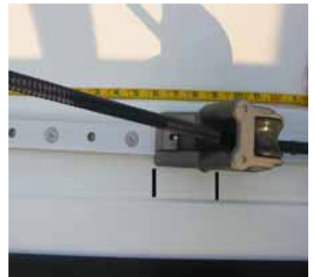
Track location with at "Light Air" setting and standard setting just aft.