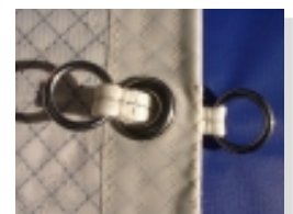
Reef luff rings are equipped with 'dog bones'