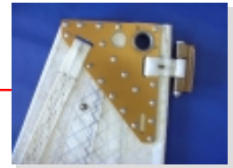
Super strong double aluminum headboards featuring hand sewn slide.

2 or 3 rows of contrasting 3-step stitching and internal leechline chafe guard