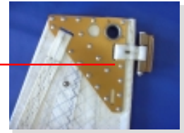
Super strong double aluminum headboards featuring hand sewn metal slide..