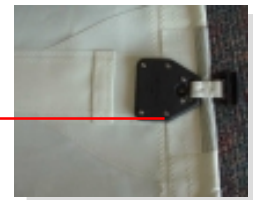
Heavy duty A-303 batten-stop with All-Slip slide.