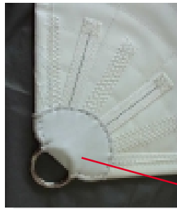
External stainless ring covered with handsewn leather.