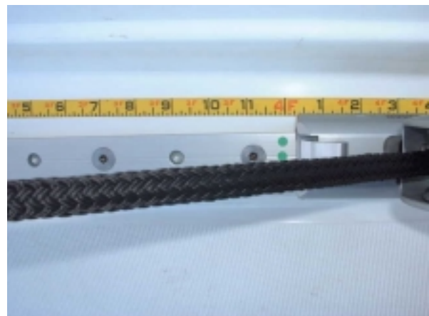
Car location when reefed to second mark