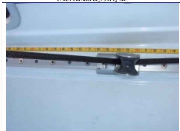
Car location at ‘standard’ position