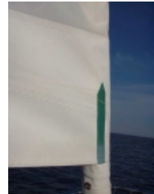
Sail reefed to first mark