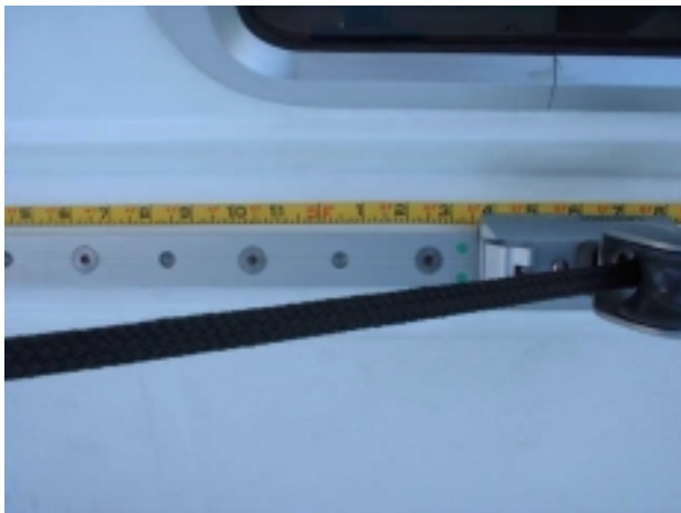
Car location when reefed to first mark