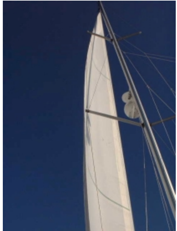
Here the genoa is completely unfurled and trimmed up for sailing upwind in about 8 knots of breeze. You can see that it is just inside the upper spreader and a few inches off the lower spreader.