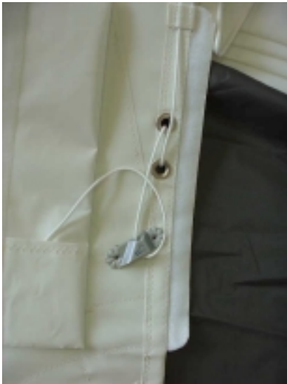
Leechline, cleat and 'tail' pocket

The first photo shows the leechline pocket opened up to reveal the leechline, snubbing eyes, cleat and the 'tail' pocket. The snubbing eyes help to take the load from the line making cleating and nucleating an easy task. The 'tail pocket' is on the inside of the leechline cover and you can put the excess leechline tail into this pocket before closing the cover